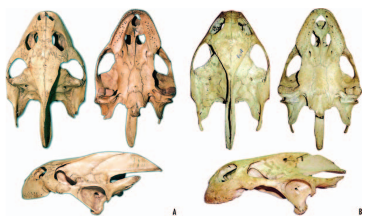
Fig. 3. Dorsal, ventral, and lateral aspects of Vietnamese Rafetus skulls collected at Bang Ta, Ba Vi, Hanoi (IEBR NQT85; A) and Quang Phu, Thanh Hoa Province (Institute of Biotechnology, Hanoi; B). Not to scale. Note that the maxillae are completely separated by the vomer in A, whereas they are in contact in B.