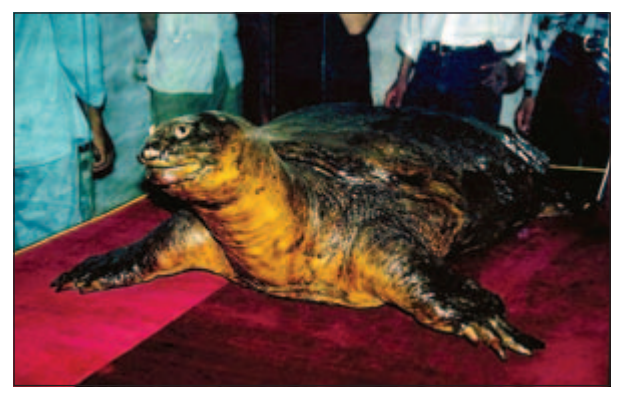
Fig. 2. Large stuffed softshell turtle originating from Hoan Kiem Lake and put on public display in Ngoc Son temple, Hanoi, the holotype of Rafetus leloii Ha, 2000.

Neither the diagnosis, nor the description mentions any specific morphological characteristic distinguishing R. vietnamensis from R. swinhoei. The only clue given by Le et al. (2010) is the size of the head, which in R. vietnamensis "is significantly larger and the snout is less protruded than that of Pelochelys bibroni and R. swinhoei." No comparative material or referred literature is listed, and the statement is not backed by hard data. The genera Pelochelys and Rafetus are known to differ markedly in a number of features (e.g., Meylan, 1987; Farkas and Fritz, 1998; Pritchard, 2001; Nguyen et al., 2007), but "head size" is not an easy to quantify characteristic. Although reference material of matching dimensions is apparently non-existent in museum collections and the available data are practically incomparable, skulls of Pelochelys cantorii we have been able to personally examine were, indeed, flatter and narrower relative to bony disk length than any Rafetus skull, and had a much wider postorbital bar relative to orbit diameter. On the other hand, while skull width relative to basicranial/skull length is extremely variable within each (purported) taxon, as a whole it is not appreciably different between Pelochelys bibroni, P. cantorii, R. swinhoei, and/or R. vietnamensis (Table 1).