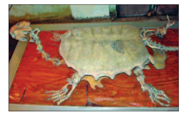
Fig. 1. Incorrectly assembled skeleton of a large female softshell turtle from Hoan Kiem Lake, Hanoi, exhibited in Hung Ky pagoda, Hanoi, the holotype of Rafetus vietnamensis Le et al., 2010.